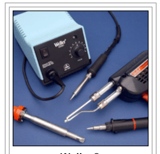
Weller® Soldering tools, rework/repair tools, soldering guns and irons and accessories